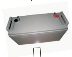
Battery Bank ( 12V/24V )